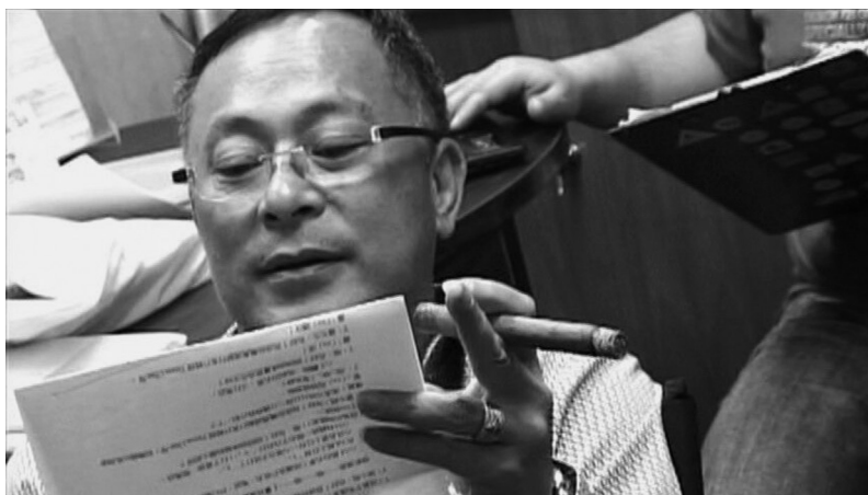
Figure 1: Johnnie To Kei-fung on the set of Life without Principle (2011). 'Making of Life without Principle ' featurette, Life without Principle , DVD extras, Hong Kong.

cinema in the global spotlight at a period of precipitous industrial decline. Today, Johnnie To still looms large both as a major film stylist on the world stage and as a beacon of Hong Kong cinema's future vitality.