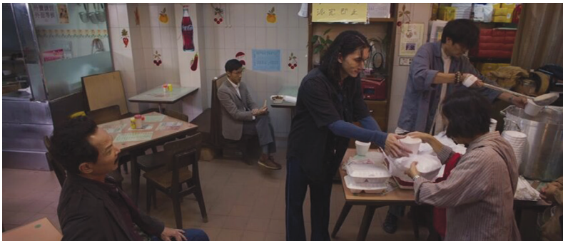
Figure 7: Director Soi Cheang's Mad Fate (2023) displays the sort of cogently staged and dramatically pregnant compositions associated with its producer, Johnnie To. Soi Cheang (dir.), Mad Fate, 2023. Hong Kong.

JT: His command of camera language is very good. He doesn't know how to make a script, I must say [laughs]. But his camera sense is so good. He can use the camera very well, and his shot compositions are very strong. He has his own style. I tell the young filmmakers, 'Try to make what belongs to you . Don't