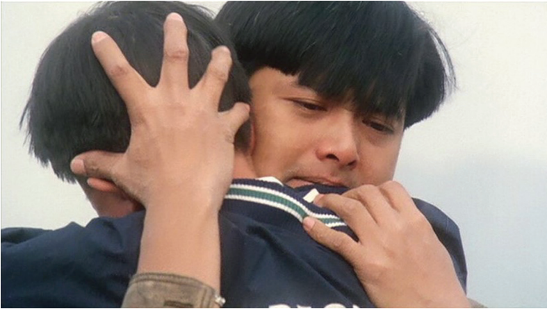
Figure 3: Chow Yun-fat in the paternal melodrama All About Ah-Long (1989). Johnnie To (dir.), All About Ah-Long, 1989. Hong Kong.

records. After that, the studio told me: 'OK, now you can do whatever you want for your next movie'. I did not want to shoot another comedy like The Eighth Happiness . I told the studio: 'I want to cast Chow Yun-fat'. I had known him for many years. His dramatic acting is very, very good. So I decided to make All About Ah-Long . This was a bold move because, in that period, nobody in Hong Kong went to watch dramas. The producers predicted that the movie would die at the box office. They said, 'You are not on the right track'. But I had been given the chance to make my movie the way I wanted to, so I didn't care what they said. And the movie was a big success.