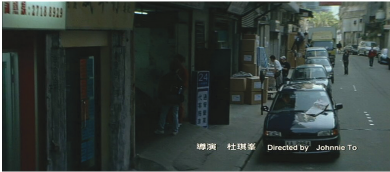
Figure 6: A newspaper floats perfectly into place in the stunning opening sequence shot from Breaking News (2004), Johnnie To (dir.), Breaking News , 2004. Hong Kong.

newspaper took seven attempts before I got what I needed. It kept landing in the wrong position. When this happened, I'd say, 'Cut! Cut!' before the actors could launch into the gunfight. It's lucky that this newspaper bit took place near the beginning of the scene. Finally, on the seventh attempt, the newspaper landed in the correct position, on the car windshield. And then we still had five minutes of action left to shoot! It was all very complicated and very tense. It was one of the biggest challenges I have had – bigger than betting money in a casino! I can say that it's not very good, but it's a success.