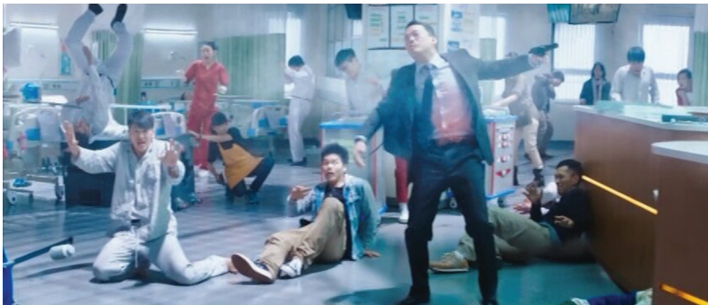
Figure 5: In Three (2016), an ostentatiously decelerated set piece depicts a bloody shootout in a busy hospital ward. Director To packs every cranny of the anamorphic frame with eye-catching detail. Johnnie To (dir.), Three, 2016. Hong Kong.

JT: I am one of those directors who does no planning. I only prepare things when I know that a particular scene or shot is going to be a problem. If a shot is not easy to control, then I will prepare. Otherwise, there is no need for preparation. For me, when it comes to how to handle the scene or the shot, I need freedom. I just follow my imagination and decide on what the shots will be when I come to the set. But if I am doing something like the opening shot of Breaking News – which is a single shot that is seven minutes long – then I know that this is a great problem for me and everyone in the cast and crew. In a case like this, I will do rehearsals and make sure that everyone knows what is needed. Only in such cases will I have the patience to rehearse, rehearse, rehearse. Another example is Three (Figure 5). For one particular sequence,